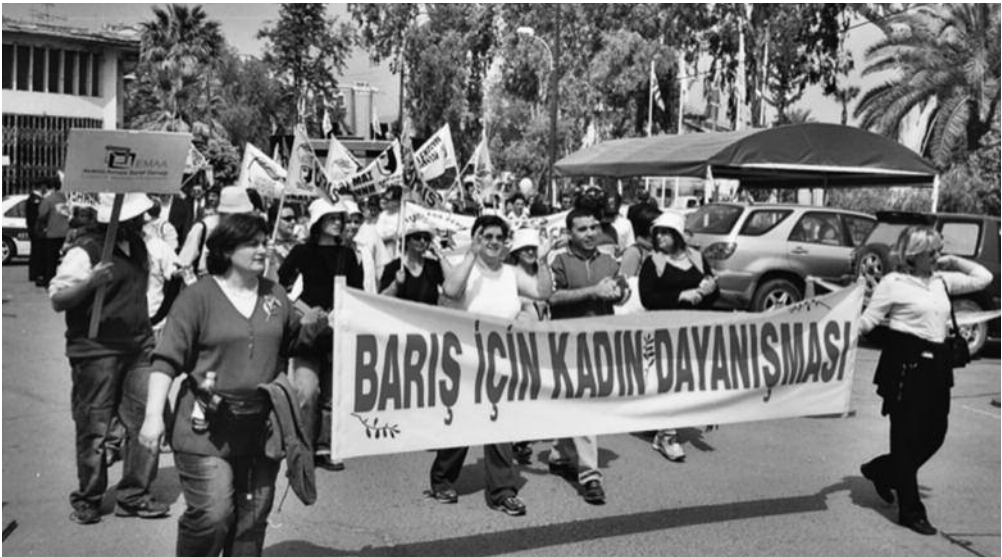
Image 8: One of the many Turkish Cypriot rallies in favor of the Annan Plan in 2004.

A leftist movement began to re-emerge in the Turkish Cypriot community in the late 1960's, after the beginnings of such a movement had been violently suppressed in the 1950's. 27 Turkish Cypriot youth studying at universities in Turkey joined that country's growing leftist movements and brought these ideas back to Cyprus. The leftist alternative, however, only began to gain influence in Cyprus in the late 1970's, when a significant opposition to mainstream nationalist politics began to develop in the community. As a result, leftist experiences of the conflict appear to differ little from those of persons with other political leanings, although narratives by those on the political left tend to differ in the retrospective interpretation of events. Narrations by members of the left tend retrospectively to emphasize the suffering of both communities and the presence of fanatical elements on both sides. Their narratives, then, tend to particularize violence to 'extremists' rather than generalizing it to 'Greek Cypriots,' while they emphasize elements of cooperation that they remember from the past.