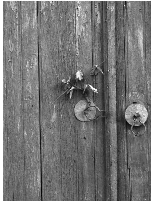
Image 5: Ruins of the former Turkish Cypriot village of Souskiou/Susuz, in the Paphos district.