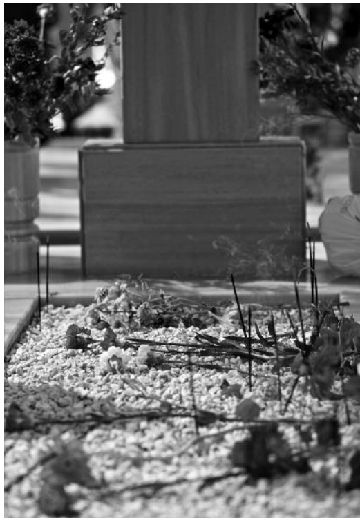
Image 19: Incense and flowers left on grave in Kokkina/Erenköy during annual ceremony to commemorate the battle of August 1964.

For one year we didn't see our men at all. We would see them from afar in the trenches, we'd go there and speak to them and run off. For a whole year they didn't come back to see their children. They would bathe with cold water in the mountains.