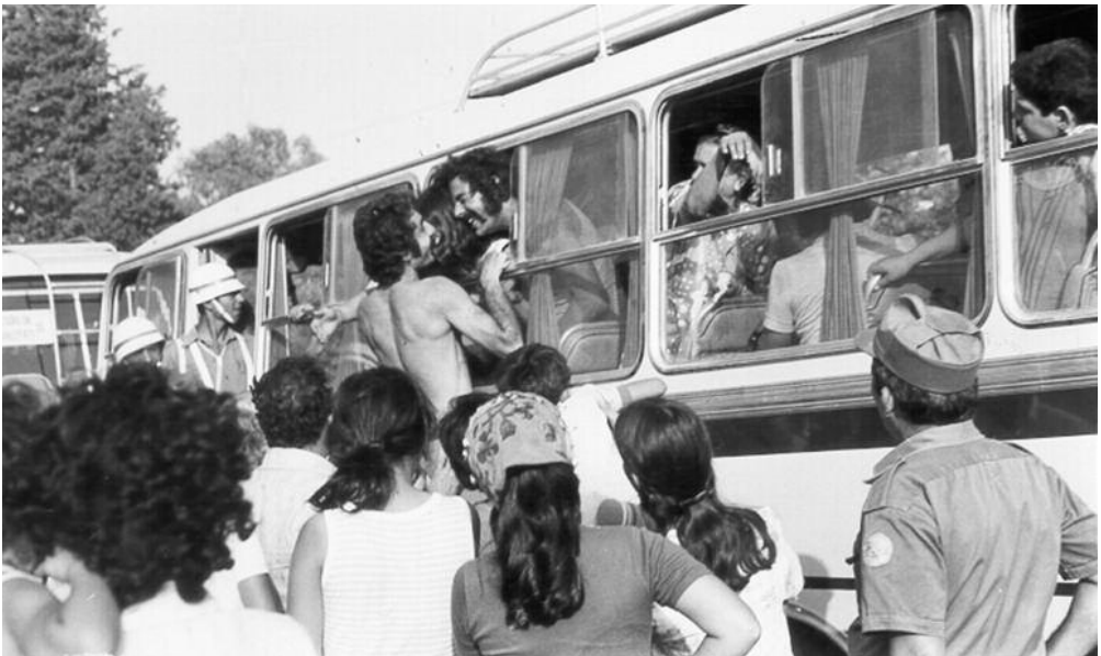
Image 2: Turkish Cypriots arrive with buses that were called 'freedom transport' (özgürlük nakliyatı) after the Vienna Agreement of 1975.

One of the most common themes in stories of displacement from 1974 is the division of families and their attempts to reunite in the island's north. In the south of the island, men and women were often separated, as men were rounded up and taken as prisoners of war, later to be sent to the north in prisoner exchanges. Women tended to find their own routes to join their husbands and families. Not only were families separated and scattered because of the war, but also it was very difficult to receive news about one's family members. Moreover, while many parents attempted to send their children to what they saw as the relative safety of the north, often they themselves remained to protect their property with the assumption that once the danger passed, their children would be able to return. The Vienna Agreement of September 1975 enabled the reunification of families while at the same time facilitating the displacement of the 10,000 Turkish Cypriots who had resisted leaving their homes and properties. Many of those who were transferred with the Vienna Agreement say that they continued to believe for many years that they would eventually be able to return to their homes.