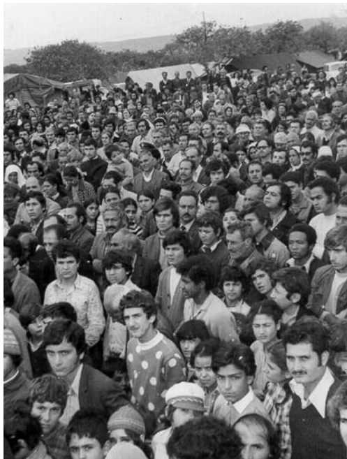
Image 4: Turkish Cypriots at the Akrotiri base await transport to the north via Turkey.

Despite this difference, however, one factor that unites the experiences of ninety percent of the Turkish Cypriot population and distinguishes them from those of Greek Cypriots is the life of the enclaves between 1963 and 1974. Although many Turkish Cypriots were not displaced until 1974, most nevertheless report a life of fear and restriction during the previous decade. This unites them with Turkish Cypriots from throughout the island during this period, who report living in cramped conditions and in what may be called an 'anticipation of violence,' which one of our interviewees summed up by saying, 'Fear was realized between people by allusion and innuendo.' This anticipation of violence, however, also resulted in stress over extended periods of time, though it should be noted that a recent psychological survey indicates that stress was higher for those displaced than for non-displaced persons on the whole. 25