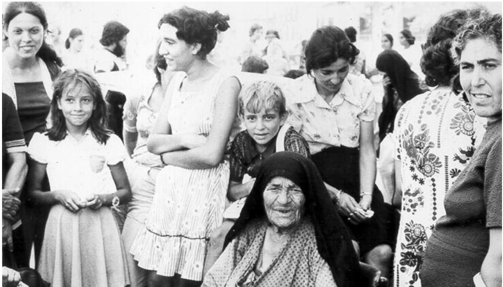
Image 7: Women waiting for loved ones to arrive in north Cyprus, 1975.

Women's narratives of the conflict tend to differ from men's, both in particular experiences that they relate and in forms of narration. One of the most important findings from the author's previous research, confirmed in these interviews, is that women relate experiencing extraordinary stress during the 1963-74 period because of the universal conscription of men into the Turkish Cypriot army and the waiting that women endured each day as men went to guard duty, as well as the quotidian struggles for survival that many relate during this period. Women's stories tend to reveal details about the struggles of displaced families to provide for their children, including the difficulties of finding necessities such as milk or adequate shelter. One woman displaced in early 1964, for instance, described how her family took shelter first with relatives, then in a dilapidated storage shed, then in a Red Crescent tent, and finally, in 1970, in social housing built by the Turkish Cypriot administration. Both women's experiences and their narrations of those experiences, then, tend to focus on struggles of the everyday. 26