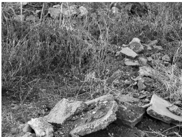
Image 9: The only remains of the Turkish Cypriot village of Ayios Epiphanios/ Aybifan in Nicosia district.

As noted earlier, Greek Cypriot official narratives, institutionalized in education and refugee associations, have since 1974 emphasized remembrance of villages and the right of return. Confrontation with this politics of remembrance after the 2003 opening led to several responses by Turkish Cypriots. The first may be seen as a 're-refugizing' of Turkish Cypriot experience, or a new nostalgia for former villages that was not articulated before 2003. This was often expressed as a desire to show that 'we are also refugees' and 'we also lost our property and suffered.'