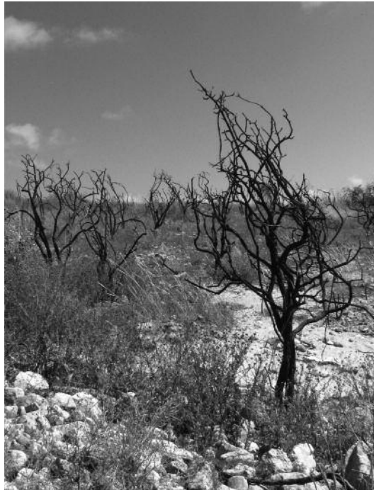
Image 17: Burned trees where the Turkish Cypriot village of Finike once stood and which today is a dam.

For instance, when the This Country Is Ours platform was formed, I supported it. I was thinking, both sides suffered, we lost our property, we lost loved ones, and now we're smarter. But later I saw that both the Greek Cypriots I had known before 1974 and the ones I met after the opening always look at you as a Turk, and they say things that are unacceptable. For example, they ask, 'What are Turkish soldiers doing here? Why did people leave here?' Like they don't know. 'The army's going to leave and you'll return to your homes,' they say. When I say I don't have a home anymore, they say we'll build one for you. Okay, but I came here when I was 25 years old and now I'm 63. I spent more of my life on this side than on that one. I can't return, and in any case my body couldn't take going back and starting again. I want a bicomunal, bizonal federation like the UN has accepted. We don't need to live together; let's live apart and get along well.