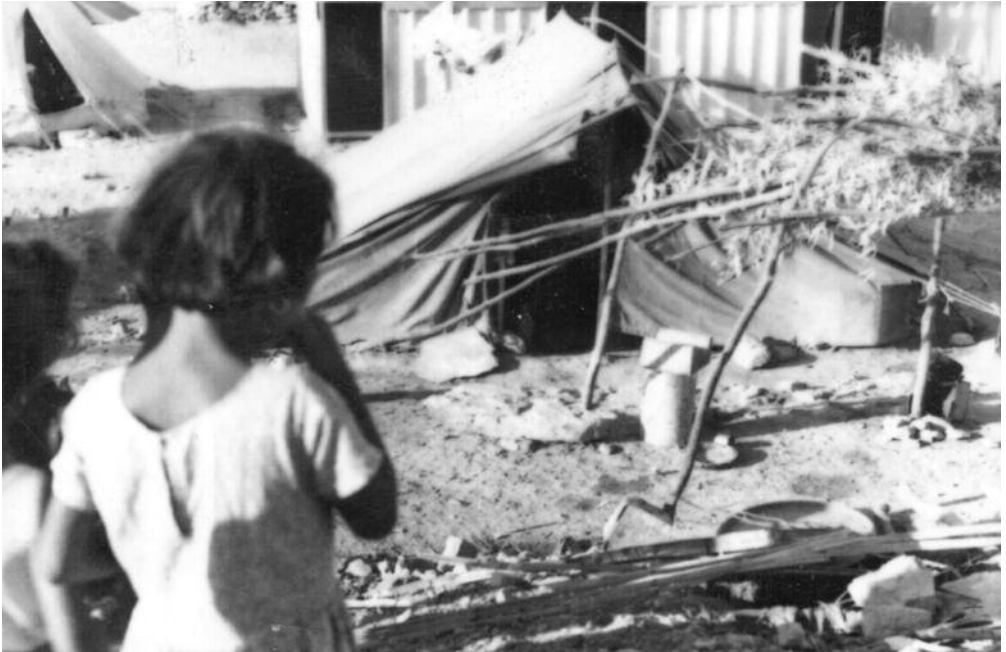
Image 1: Displaced Turkish Cypriot children in a refugee camp outside Nicosia, 1964.