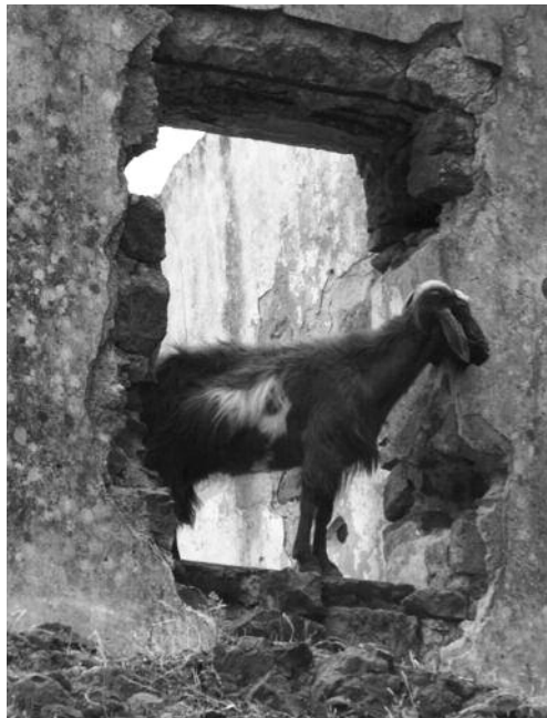
Image 20: Goat among the ruins of one of two buildings still visible in Alevga/Alevkaya.

After the opening of the checkpoints in 2003, they went back to see their village, but there was nothing left. They say that their houses had been built of stone, but even the stones had disappeared. Nothing was left of the many trees that they remember from their childhood. When asked if they would think of returning, they both exclaim, 'No, never! We have no village anymore.'