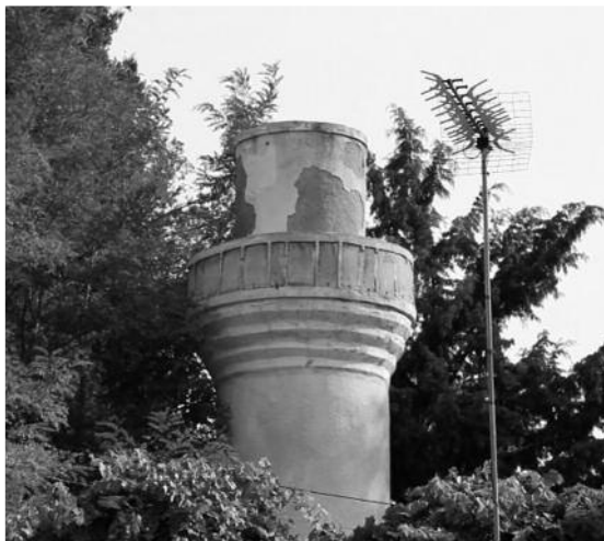
Image 11: The mosque in the Turkish neighborhood of Koilani/Gilan village.

They stayed for about a year in Polemidia, but Kemal says that because they were wealthy landowners, they were not given sufficient rations. They decided to return to Koilani, but neither their house nor their fields and gardens were as they had left them. Their fellow villagers had taken their crops, animals, and farm machinery, and their home had been damaged.